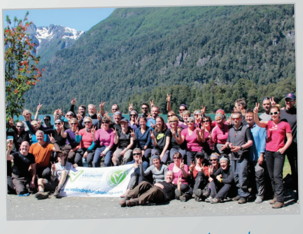
The end of a tough trek