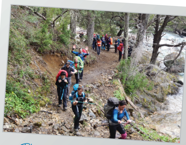
Through the Andean forest